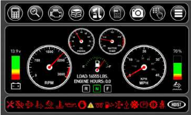
Smart Screen Technology - Neptune Series

Hydraulic schematics, wiring diagrams, and fuse/relay diagnostics are available directly through the SST display, making diagnosing technical issues easier than ever before. That's important because every minute of uptime translates to productivity and revenue.